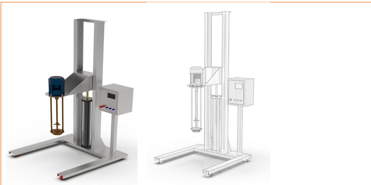
Vertical mixing stations Portable for easy application requirements Processable from direct tanks or bulk contains.

Contact us for customized solutions, engineering, design & manufacturing!