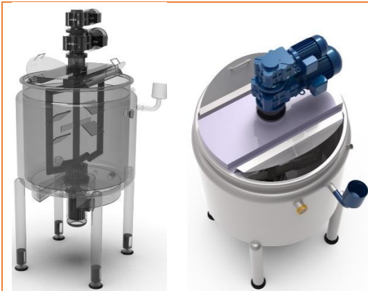
Tank assemblies with mixers. Customisation possible. Various tank sizes designed for manufacturing